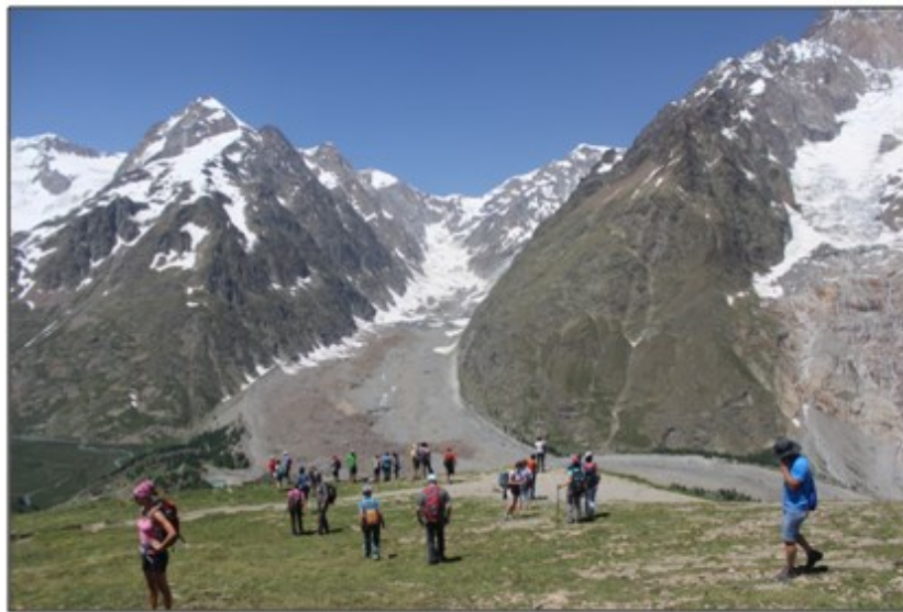
terminal moraine view of Brenva and Miage glaciers